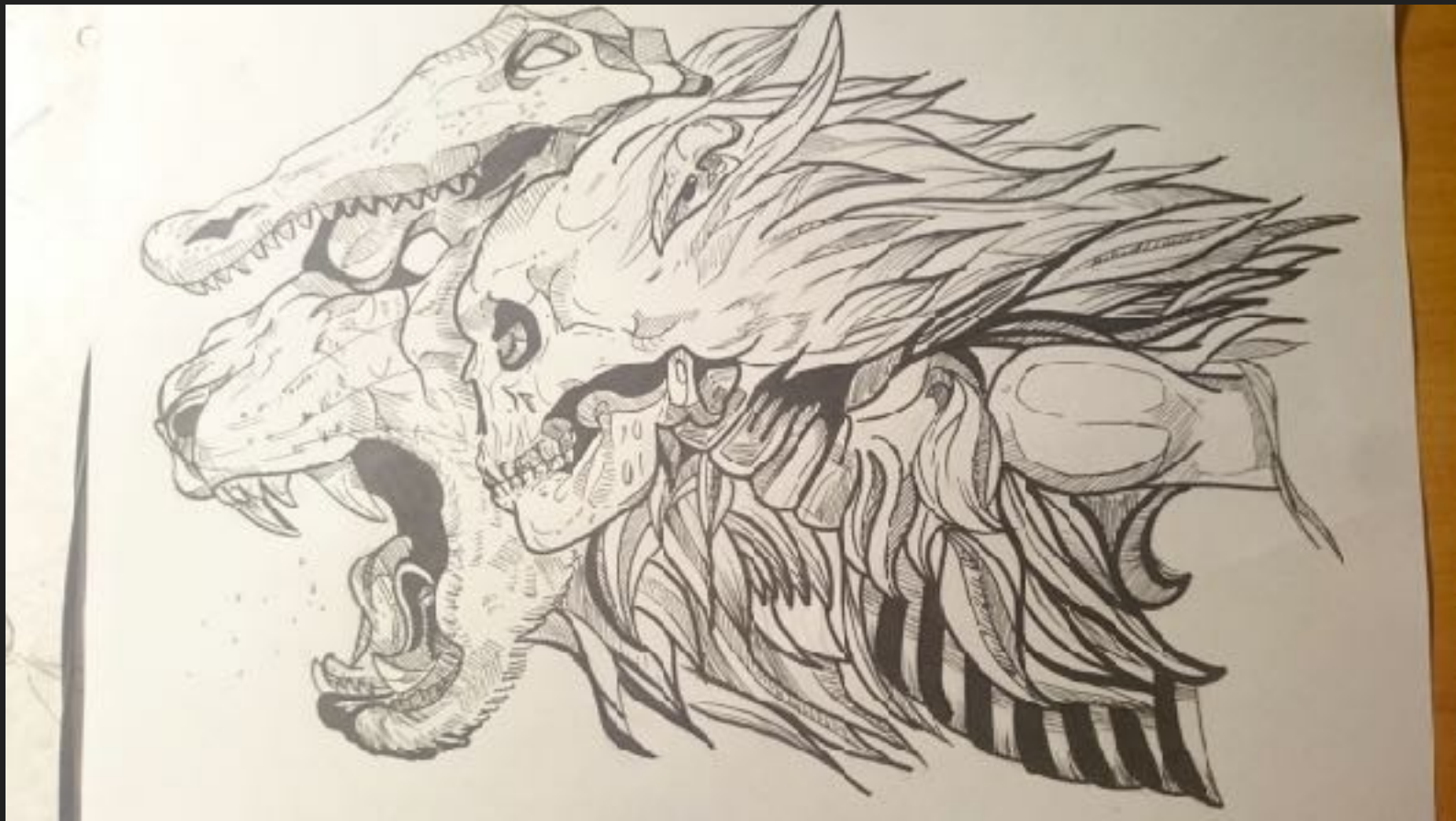
Drawing & Sketching & Drafting