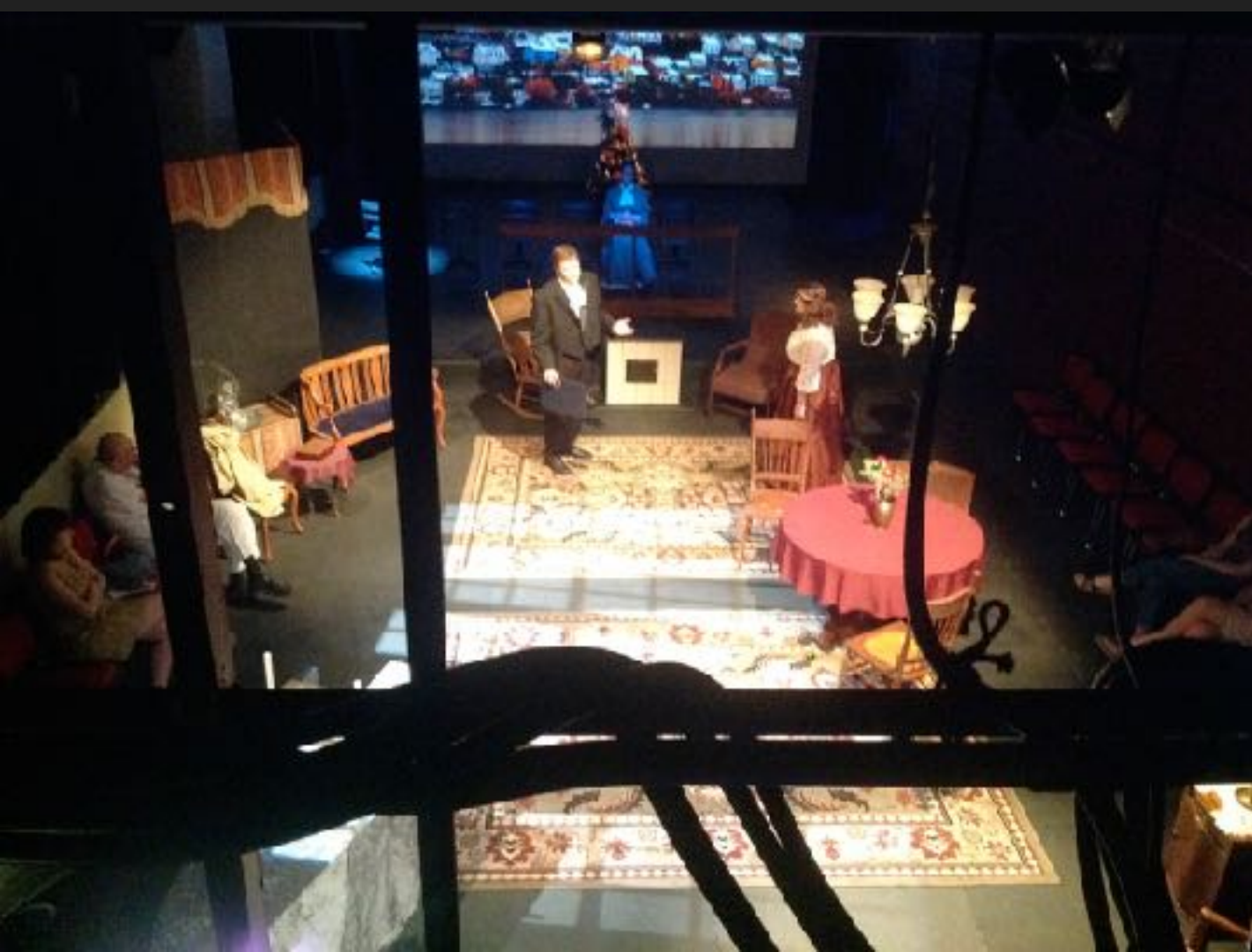
Lighting Design for A Doll's House